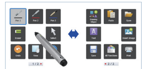
All AQUOS BOARD interactive display system models are equipped with user-friendly Sharp Pen Software.