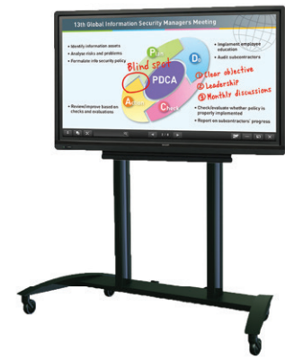
Sharp PN-L703B AQUOS BOARD interactive display system shown with optional PN-SR780M rolling cart.